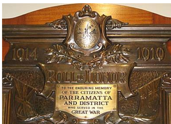
Parramatta & District Great War Roll of Honour