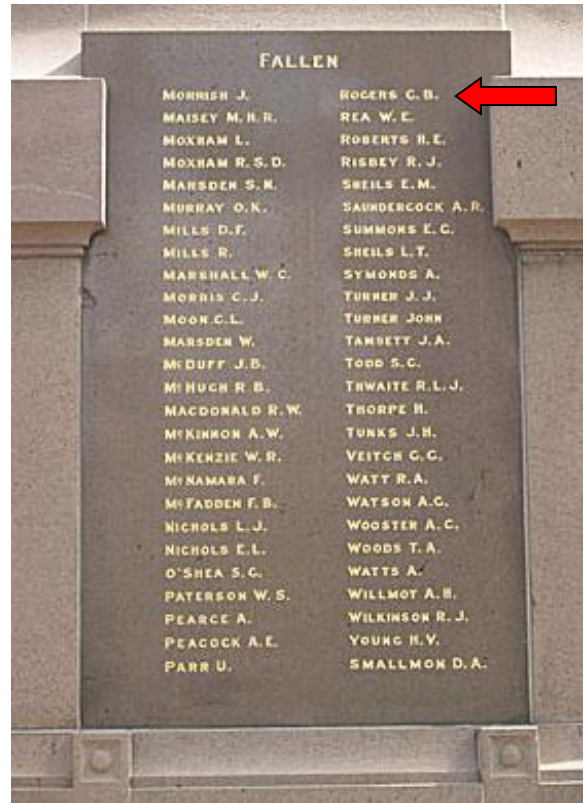
Parramatta War Memorial