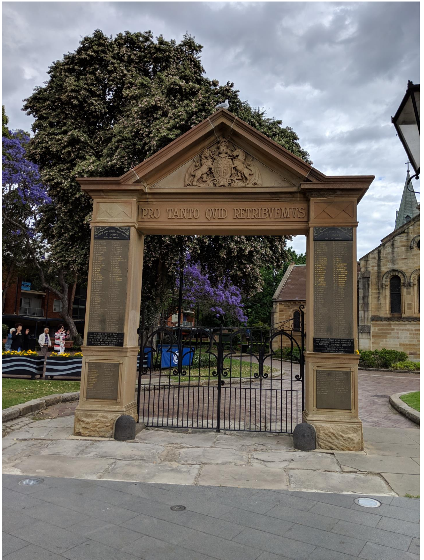
St. John's Anglican Cathedral Memorial Arch