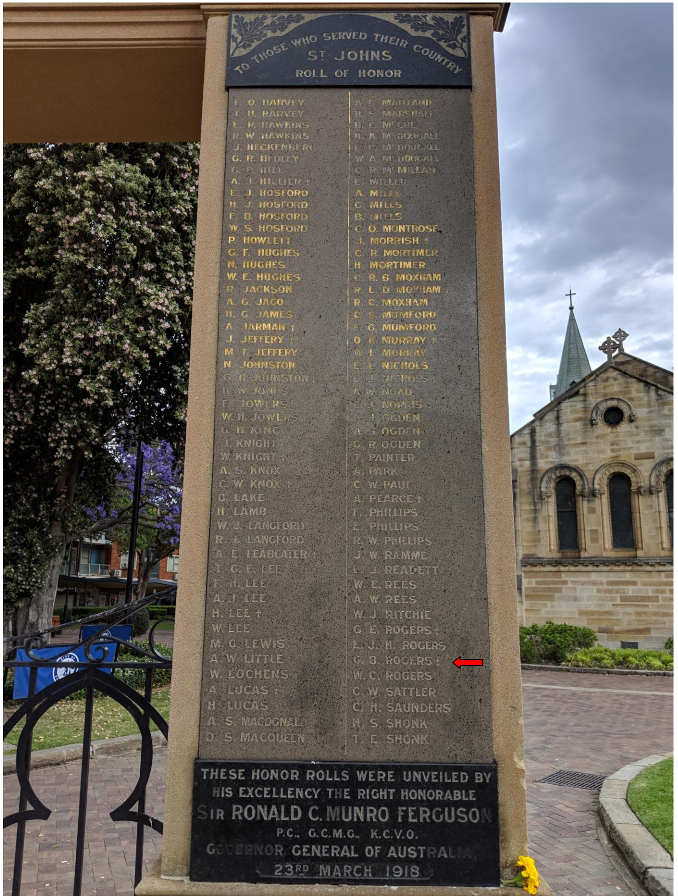
St. John's Anglican Cathedral Memorial Arch (right side)